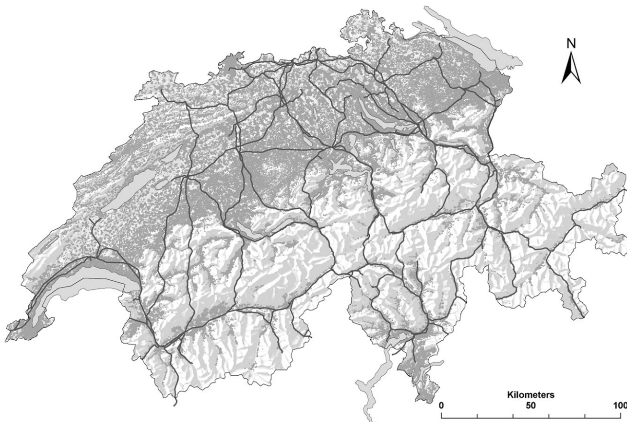
Figure 1. Power lines and buildings in Switzerland.

We used age as the underlying timescale in our models. All models were adjusted for sex; educational level (compulsory education, secondary level, and tertiary level); highest reported occupational attainment by code (4 levels extracted from the International Standard Classification of Occupations of 1988—1) legislators, senior officials, managers, and professionals, 2) technicians and associate professionals, clerks, service workers, and shop and market sales workers, 3) skilled agricultural and fishery workers, craft and related trades workers, plant, machine operators, and assemblers, and elementary occupations, and 4) no occupation reported); civil status (single, married, divorced, widowed); urbanization category (city, agglomeration, rural municipality); and language region (German, French, Italian). We also included the number of apartments per building into the model, a potential risk factor for magnetic field exposure due to indoor wiring (8).